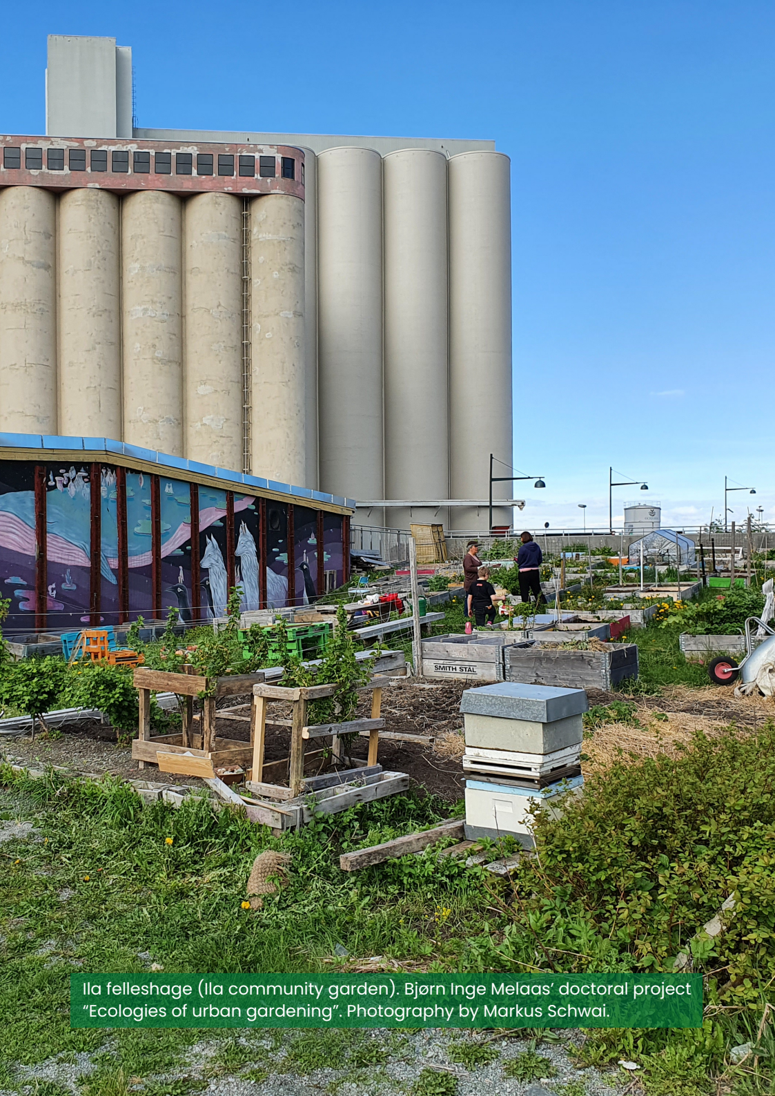
Ila fellestage (Ila community garden). Bjørn Inge Melaas' doctoral project "Ecologies of urban gardening".